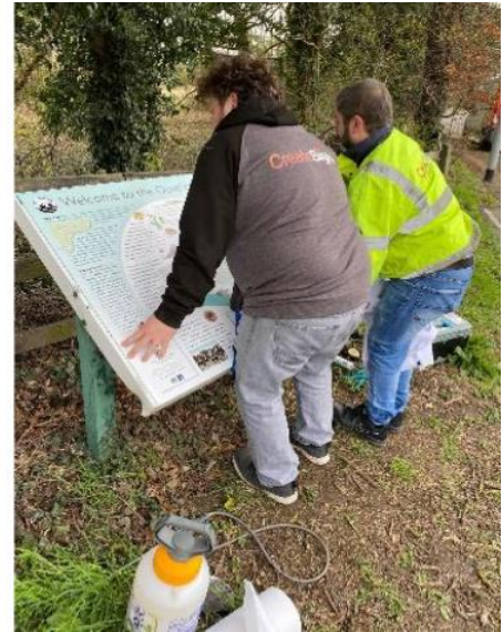
The replacement sign at Earith (left), and the Create Signs team at work (right)